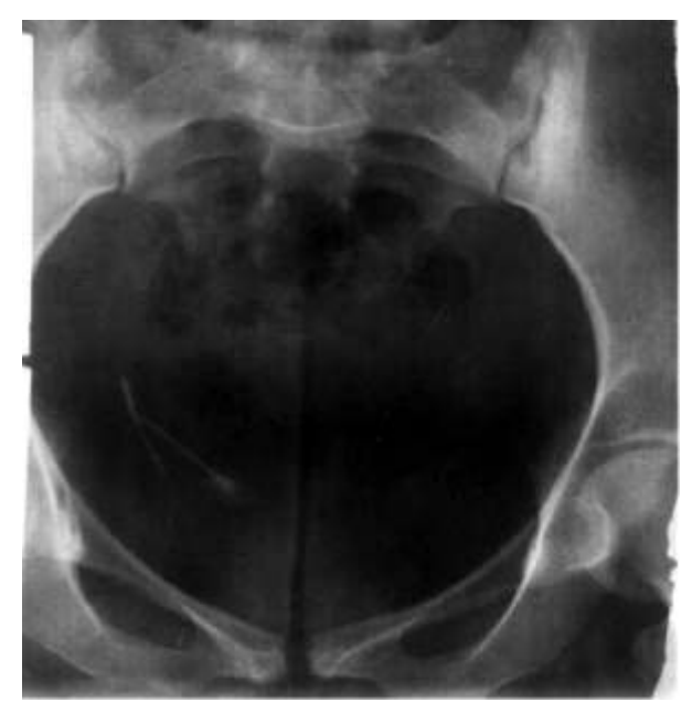
Fig 3. Partial migration of IUCD with stone formation on its vertical limb

baby, she got another IUCD inserted by a quack. Five patients had successful endoscopic retrieval of IUCD without any complication. In one of these cases the IUCD broke during cystoscopic retrieval. However, we were able to remove the complete device piecemeal (Fig 2, 3 & 4). We chose to perform cystolithotomy in one of our patients who had formed a large vesical stone over a completely migrated IUCD. A large stone (6 cm x 4.5 cm) formed over the buried IUCD (Fig 5) was removed by cystolithotomy. None of the patients developed vesico-vaginal fistula or any other complication. Remaining six patients complained of significant LUTS and had recurrent urinary tract infections after five to six years of insertion of the device (Table 2). On evaluation the device in these patients was not found to be displaced. Urinalysis in these patients revealed significant pus cells. Two patients grew E. coli in their urine. All of these six cases were treated conservatively for urinary tract infection and their symptoms settled.