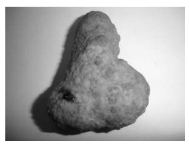
Fig 5. A large vesical tone with buried IUCD

duration in bladder. 20-22 As primary vesical stone is an uncommon pathology in females, a foreign body must be considered in case of bladder stone in females éspecially those ladies using an IUCD.