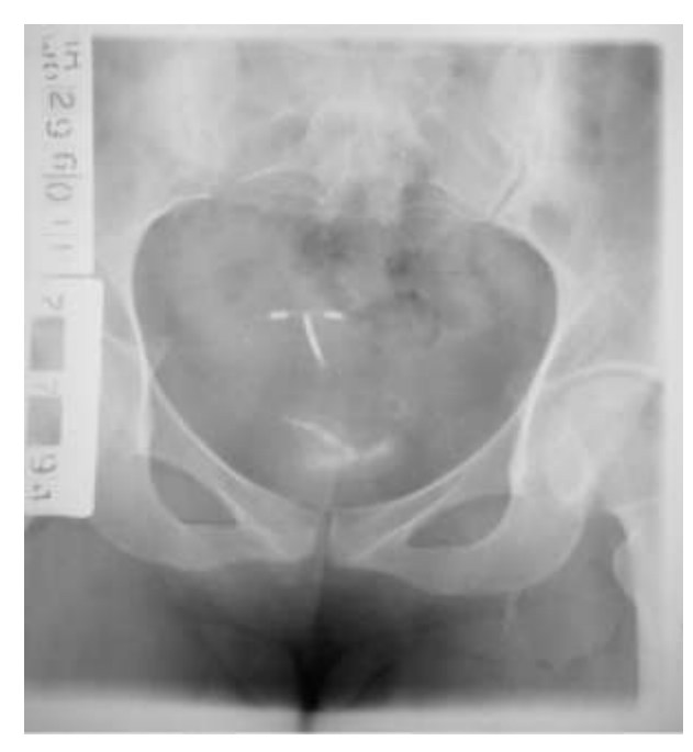
Fig 1. A patient having two IUCDs. One IUCD is covered with faint opacification.

chronic pyelonephritis, persistent lower urinary tract symptoms (LUTS) and vesico-uterine fistula. Intravesical migration of the IUCD is exceptionally rare but it must be kept in mind in women with recurrent urinary symptoms using the contraceptive devices. Diagnosis can be made with the help of ultrasound and confirmed by cystoscopy. 5 In difficult locations Computerized Tomography (CT) scan can be advised for better preoperative assessment. 8 Magnetic resonance imaging is not contraindicated in copper containing IUCDs.9 Endoscopic retrieval 5.8 of the device along with the associated stone if present is the preferred treatment modality. In those cases where it is badly stuck or embedded in the uterine and bladder wall and is difficult to retrieve endoscopically, and open surgery may be laparoscopy employed. 3,8 If there is a vesico-uterine fistula it should be repaired during open surgery. We<sup>8</sup>report a series of twelve cases of urological complications of IUCD. Six IUCDs had migrated partially or completely into the urinary bladder while the other six were present in the uterus but the patients experienced LUTS. Present study was designed as to elucidate the urological complications of IUCD.