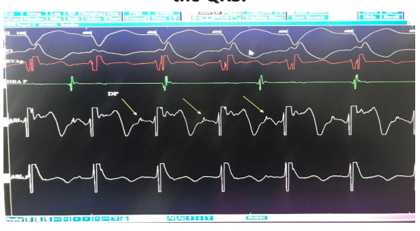
Figure 4: Electrophysiological tracing during successful ablation showing termination of tachycardia