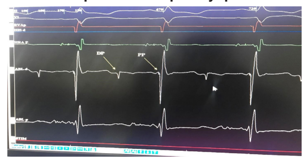
Figure 2: Mapping in sinus rhythm showing diastolic potential and purkinje potential

very good in these patients. Treatment can be medical or by radiofrequency catheter ablation which is class I recommendation for symptomatic patients. Our study data is similar to international data<sup>10,11</sup>. ILVT generally presents in young adults (15–40 years) and mainly affects males (60%–80%)<sup>11,12</sup>. The most frequent clinical presentation is paroxysmal episodes of palpitations and dizziness. Syncope and sudden death are very rare. Tachycardia induced cardiomyopathy has been described in as many as 6% of the total cases of persistent tachycardia. It is